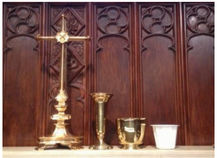
EXHIBIT 4: The gradine and dark wood behind it, with the cross and the two vase options, as well as the insert for the shorter, wider vase.