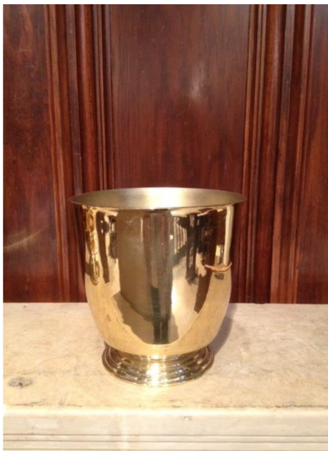
EXHIBIT 3: Shorter brass cache pot vase. The inside depth is 7\frac{1}{2} inches, and the inside diameter is 8\frac{1}{4} inches at the largest point.