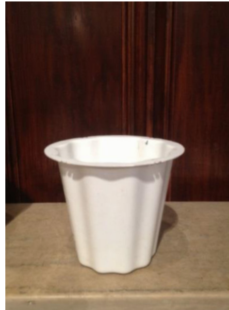
EXHIBIT 2: Insert for the shorter brass cache pot vase. It is 6\frac{1}{2} inches high and 6\frac{1}{4} inches in diameter at the largest point.