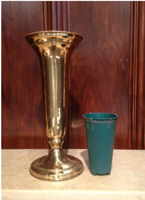
EXHIBIT 1: Traditional vase. The insert is small: 6\frac{3}{4} to 7 inches high and just over 3\frac{1}{2} inches in diameter at the widest point.